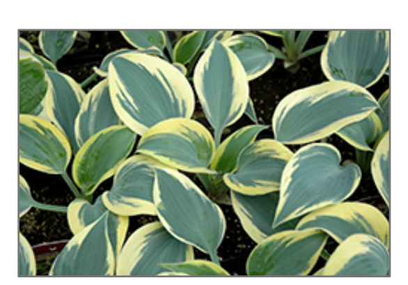
Ben Vernooji Hosta foliage