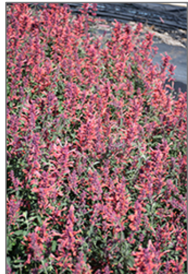
Kudos Coral Hyssop in bloom