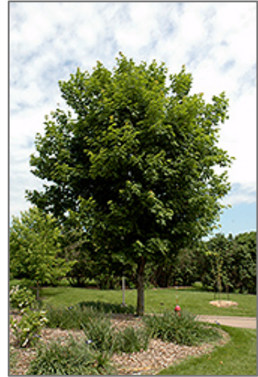
Sugar Maple

This tree should only be grown in full sunlight. It prefers to grow in average to moist conditions, and shouldn't be allowed to dry out. It is not particular as to soil pH, but grows best in rich soils. It is somewhat tolerant of urban pollution. This species is native to parts of North America.