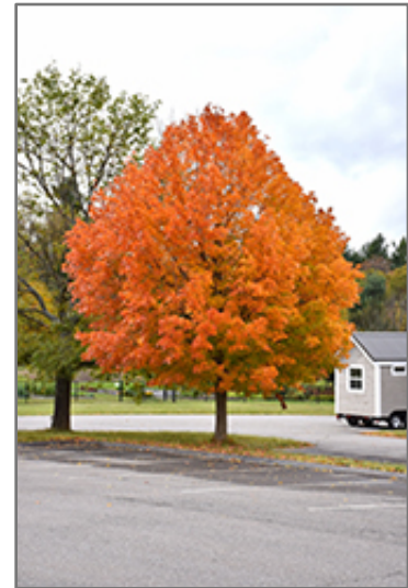
Sugar Maple in fall