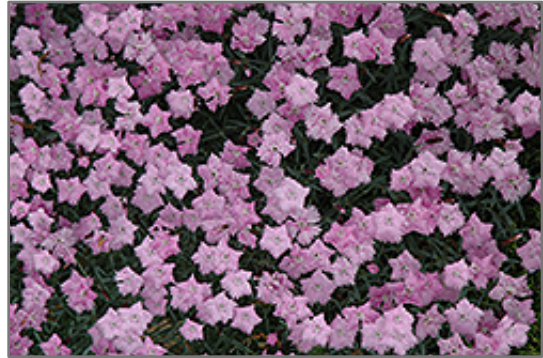
Bath's Pink Pinks in bloom

Bath's Pink Pinks is recommended for the following landscape applications;