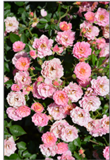
Oso Easy Petit Pink flowers