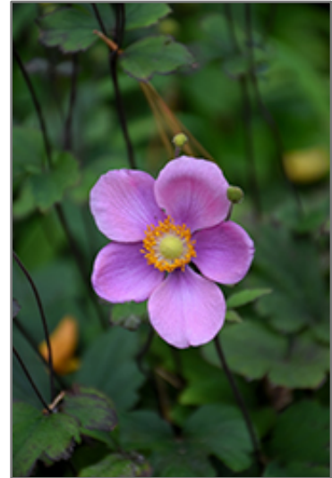
Lucky Charm Anemone flowers