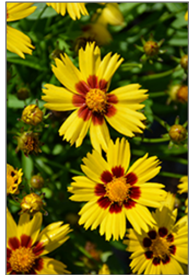
Sunkiss Tickseed flowers