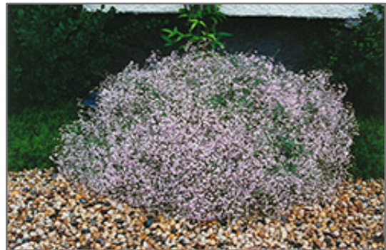
Pink Fairy Baby's Breath in bloom