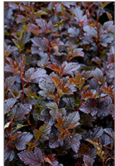
Petite Plum Ninebark foliage