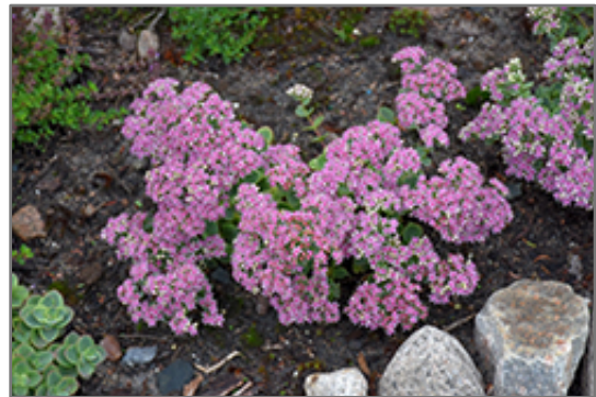
Lime Twister Stonecrop in bloom