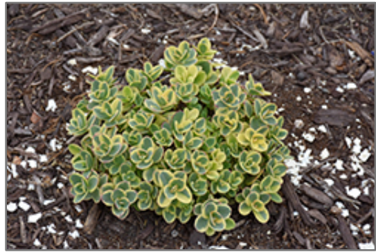
Lime Twister Stonecrop