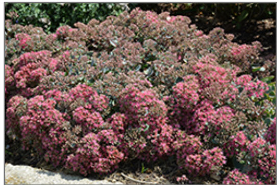
Popstar Stonecrop in bloom