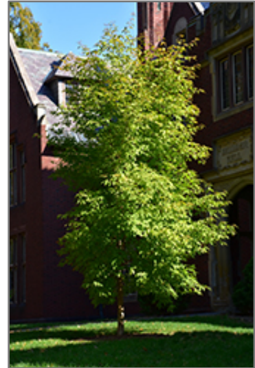
Three Flowered Maple