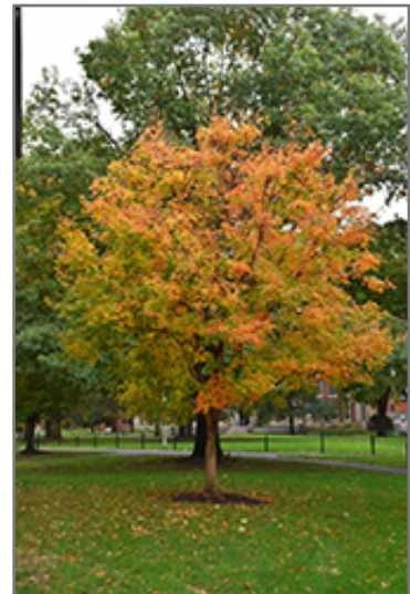
Three Flowered Maple in fall