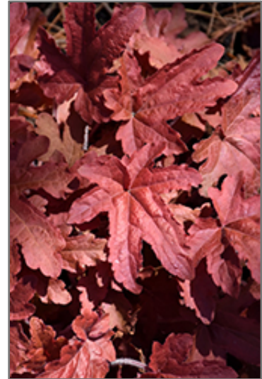
Fun and Games Red Rover Foamy Bells foliage

This is a relatively low maintenance plant, and should be cut back in late fall in preparation for winter. It is a good choice for attracting hummingbirds to your yard. It has no significant negative characteristics.