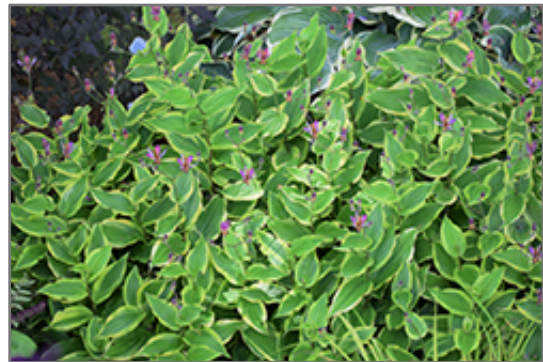
Autumn Glow Toad Lily in bloom