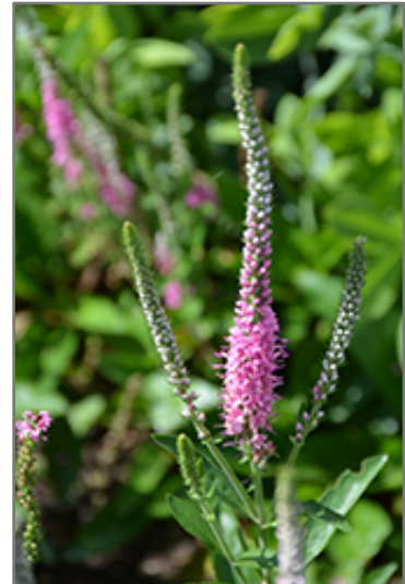
Perfectly Picasso Speedwell flowers