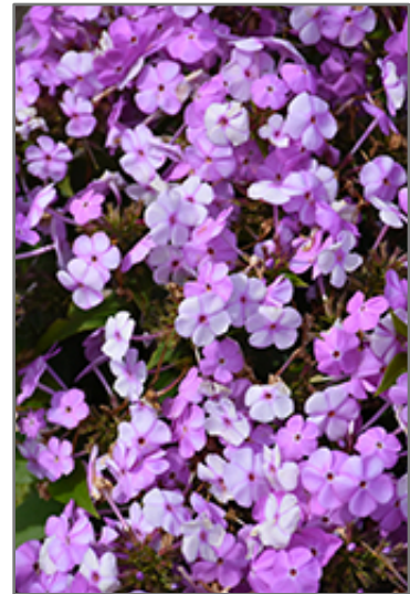
Fashionably Early Princess Garden Phlox flowers