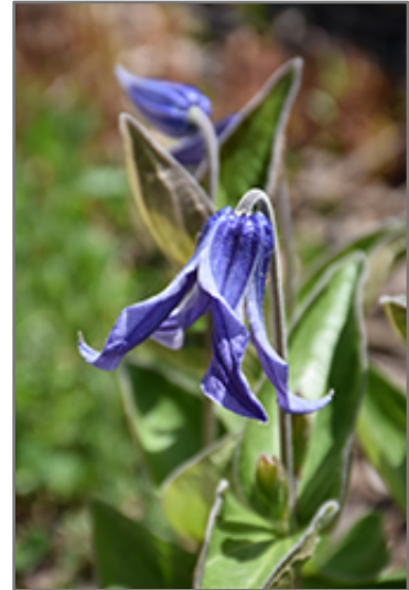
Blue Ribbons Bush Clematis flowers