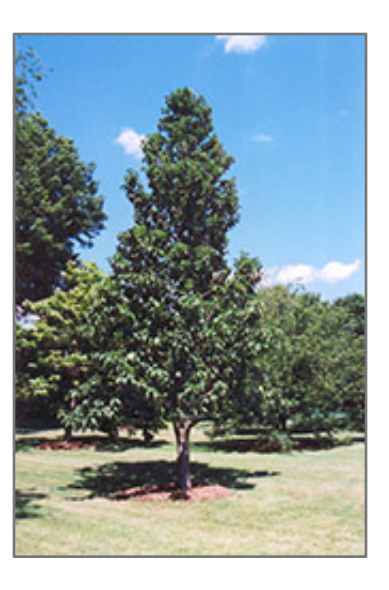
Cucumber Magnolia

This tree does best in full sun to partial shade. It requires an evenly moist well-drained soil for optimal growth, but will die in standing water. It is not particular as to soil type, but has a definite preference for acidic soils. It is quite intolerant of urban pollution, therefore inner city or urban streetside plantings are best avoided. Consider applying a thick mulch around the root zone in winter to protect it in exposed locations or colder microclimates. This species is native to parts of North America.