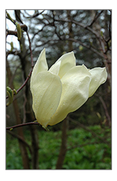
Cucumber Magnolia flowers