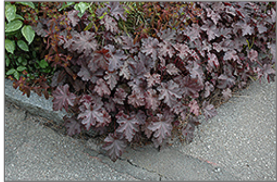
Stormy Seas Coral Bells

Stormy Seas Coral Bells is recommended for the following landscape applications;