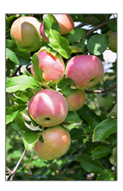
Northern Spy Apple fruit