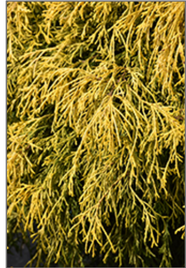
Paul's Gold Threadleaf Falsecypress foliage

Paul's Gold Threadleaf Falsecypress is recommended for the following landscape applications;