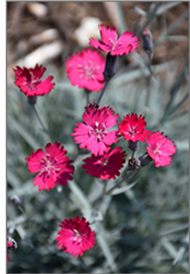
Wicked Witch Pinks flowers

Wicked Witch Pinks is recommended for the following landscape applications;