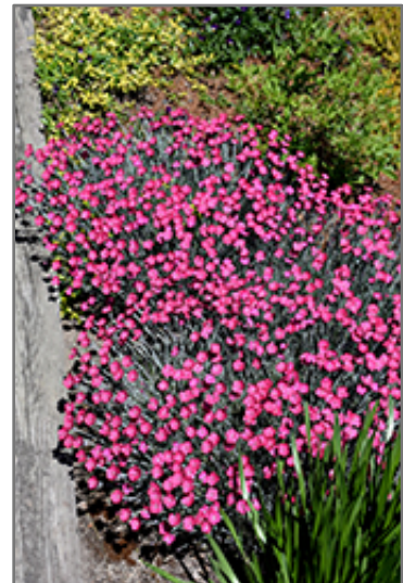
Wicked Witch Pinks in bloom