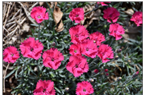
Paint The Town Magenta Pinks flowers