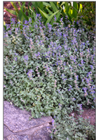
Early Bird Catmint in bloom