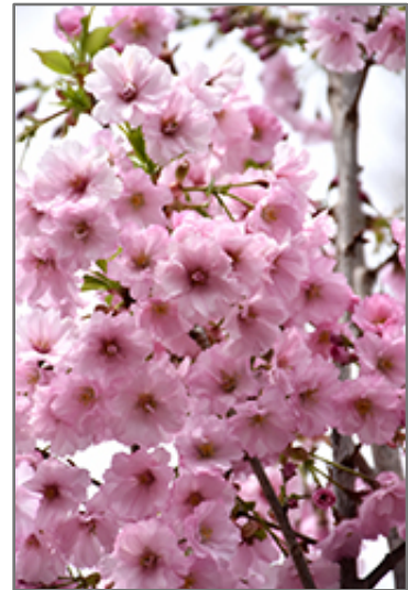
First Blush Flowering Cherry flowers