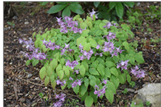
Purple Pixie Bishop's Hat in bloom