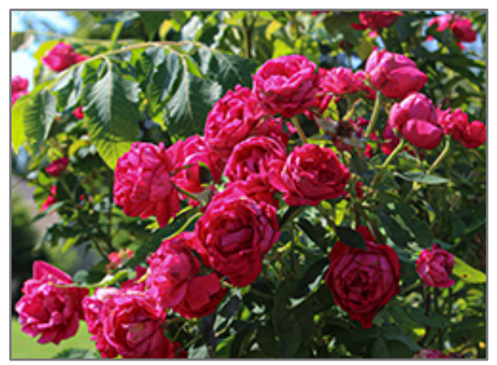
The Grand Champion Rose flowers