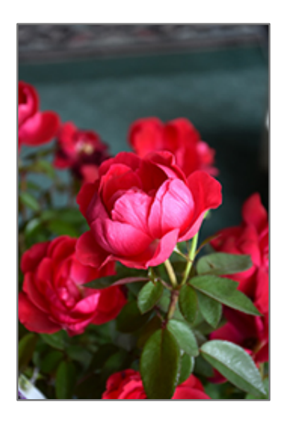
The Grand Champion Rose flowers

This shrub does best in full sun to partial shade. It does best in average to evenly moist conditions, but will not tolerate standing water. It is not particular as to soil type or pH. It is highly tolerant of urban pollution and will even thrive in inner city environments. This particular variety is an interspecific hybrid.