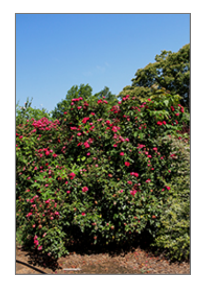
The Grand Champion Rose in bloom

CustomerCare@WestonNurseries.com 93 East Main Street Hopkinton MA 02148 - (508) 435-3414 160 Pine Hill Road Chelmsford MA 01824 - (978) 349-0055 COMMERCIAL: commsales@westonnurseries.com - (508) 293-8028