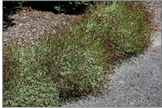
Little Angel Burnet in bloom