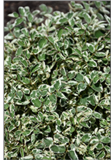
Little Angel Burnet flowers

This plant does best in full sun to partial shade. It prefers to grow in average to moist conditions, and shouldn't be allowed to dry out. It is not particular as to soil type or pH. It is somewhat tolerant of urban pollution. This is a selected variety of a species not originally from North America. It can be propagated by division; however, as a cultivated variety, be aware that it may be subject to certain restrictions or prohibitions on propagation.