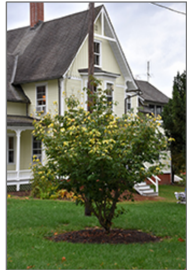
Champion's Gold Chinese Dogwood