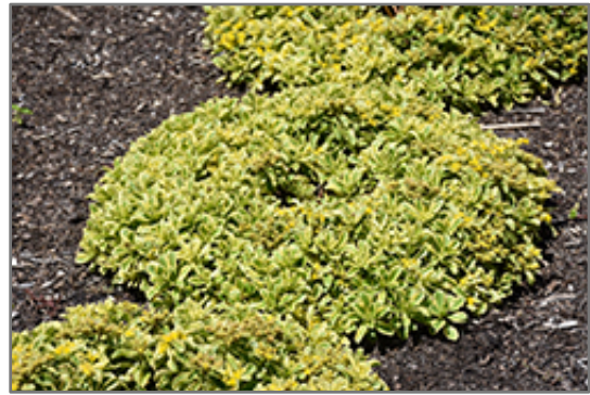
Cutting Edge Stonecrop

Cutting Edge Stonecrop will grow to be only 6 inches tall at maturity, with a spread of 16 inches. When grown in masses or used as a bedding plant, individual plants should be spaced approximately 12 inches apart. Its foliage tends to remain low and dense right to the ground. It grows at a fast rate, and under ideal conditions can be expected to live for approximately 15 years. As an herbaceous perennial, this plant will usually die back to the crown each winter, and will regrow from the base each spring. Be careful not to disturb the crown in late winter when it may not be readily seen!