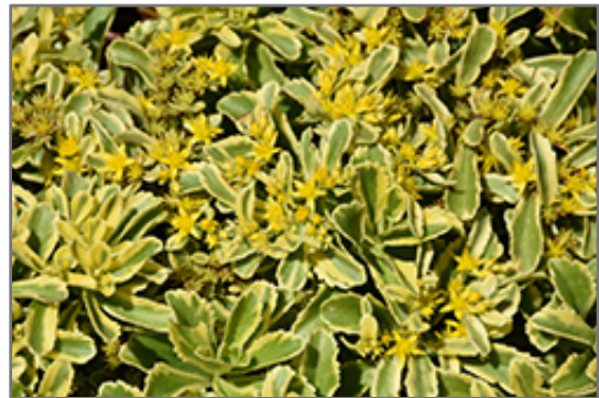
Cutting Edge Stonecrop flowers