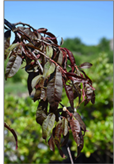
Crimson Cascade Weeping Peach foliage

This tree should only be grown in full sunlight. It does best in average to evenly moist conditions, but will not tolerate standing water. It is not particular as to soil type or pH. It is highly tolerant of urban pollution and will even thrive in inner city environments, and will benefit from being planted in a relatively sheltered location. This is a selected variety of a species not originally from North America.