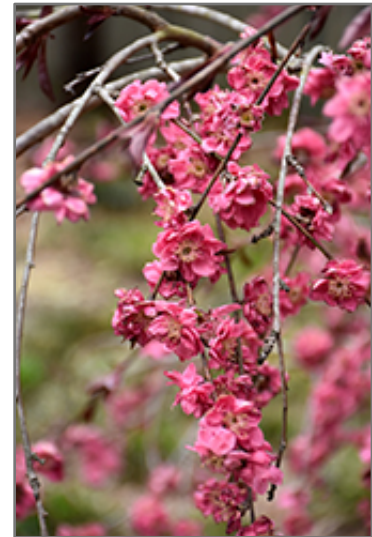
Crimson Cascade Weeping Peach flowers

Crimson Cascade Weeping Peach is recommended for the following landscape applications;