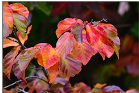
Persian Parrotia in fall