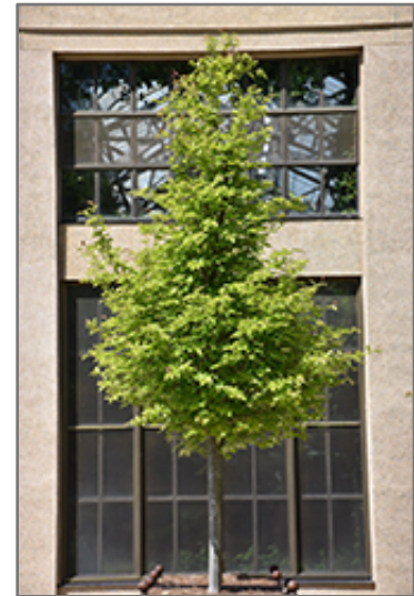
Persian Parrotia