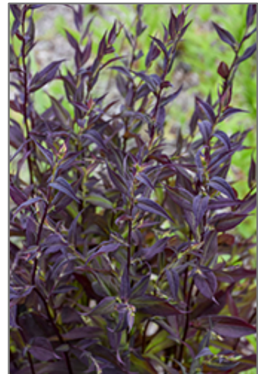
Lady In Black Calico Aster