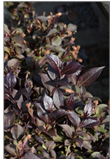
Coco Krunch Weigela foliage