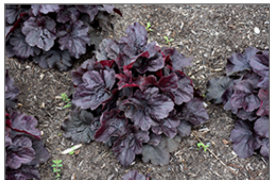
Northern Exposure Black Coral Bells