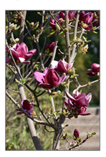
Genie Magnolia flowers