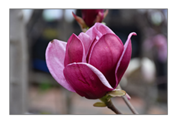
Genie Magnolia flowers