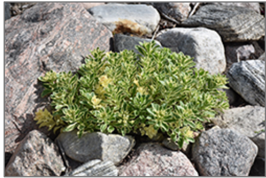
Atlantis Stonecrop

Atlantis Stonecrop is a fine choice for the garden, but it is also a good selection for planting in outdoor pots and containers. It is often used as a 'filler' in the 'spiller-thriller-filler' container combination, providing a mass of flowers and foliage against which the larger thriller plants stand out. Note that when growing plants in outdoor containers and baskets, they may require more frequent waterings than they would in the yard or garden.