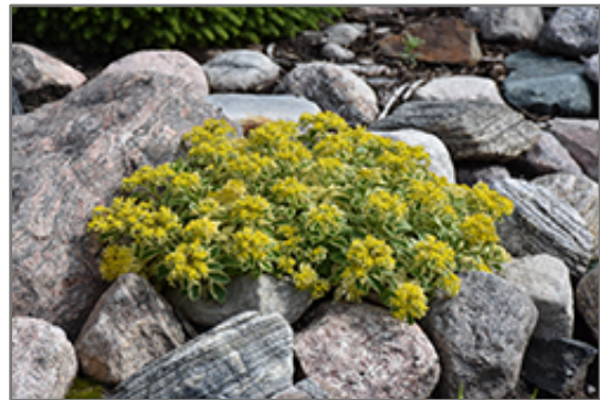
Atlantis Stonecrop in bloom