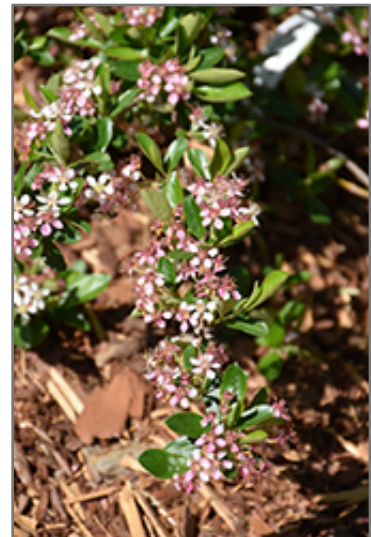
Ground Hug Aronia flowers