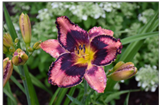
Rainbow Rhythm Storm Shelter Daylily flowers