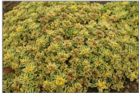
Rock 'N Low Boogie Woogie Stonecrop flowers

Rock 'N Low Boogie Woogie Stonecrop is a dense herbaceous perennial with a mounded form. Its medium texture blends into the garden, but can always be balanced by a couple of finer or coarser plants for an effective composition.