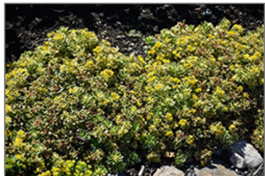
Rock 'N Low Boogie Woogie Stonecrop in bloom