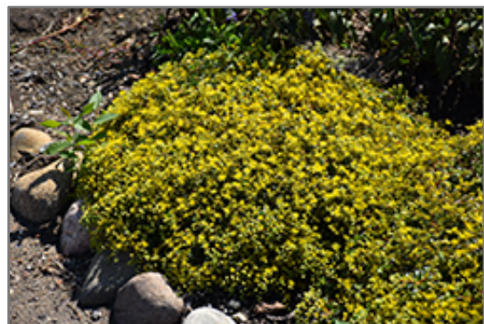
Rock 'N Low Yellow Brick Road Stonecrop in bloom