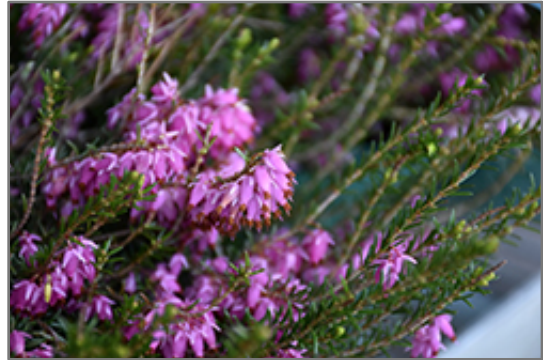
Pink Spangles Heath flowers