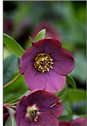
Honeymoon Rome In Red Hellebore flowers

Honeymoon Rome In Red Hellebore is recommended for the following landscape applications;