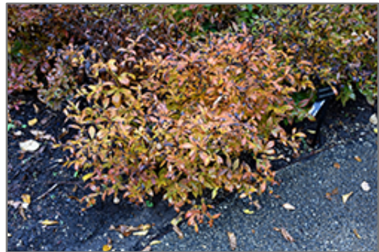
Bowman's Root in fall