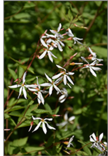
Bowman's Root flowers

This plant will require occasional maintenance and upkeep, and should be cut back in late fall in preparation for winter. It is a good choice for attracting bees and butterflies to your yard. It has no significant negative characteristics.