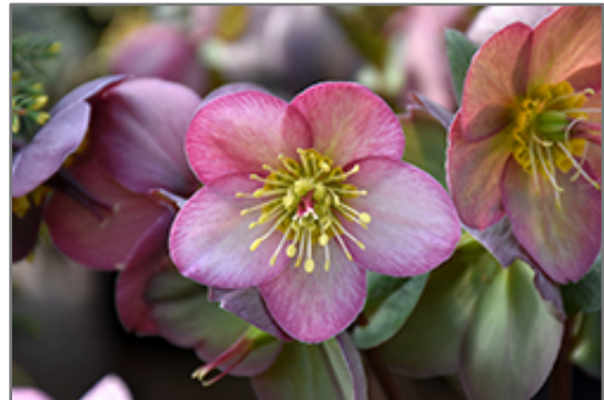
FrostKiss Cheryl's Shine Hellebore flowers

This is a relatively low maintenance plant, and should be cut back in late fall in preparation for winter. Deer don't particularly care for this plant and will usually leave it alone in favor of tastier treats. It has no significant negative characteristics.