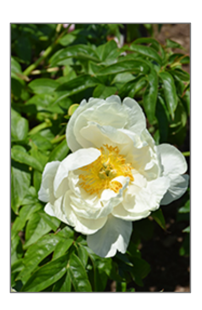
Prairie Moon Peony flowers

Prairie Moon Peony will grow to be about 24 inches tall at maturity, with a spread of 30 inches. When grown in masses or used as a bedding plant, individual plants should be spaced approximately 26 inches apart. The flower stalks can be weak and so it may require staking in exposed sites or excessively rich soils. It grows at a slow rate, and under ideal conditions can be expected to live for approximately 20 years. As an herbaceous perennial, this plant will usually die back to the crown each winter, and will regrow from the base each spring. Be careful not to disturb the crown in late winter when it may not be readily seen!