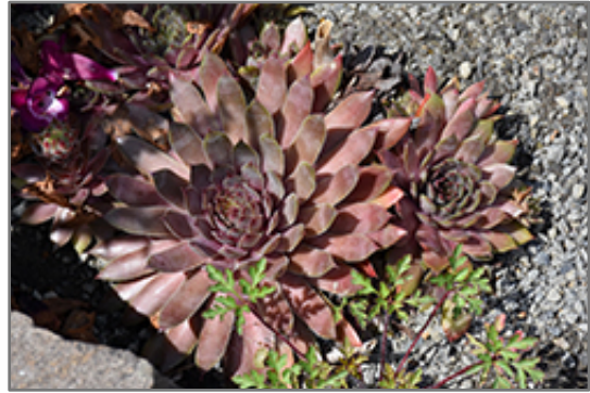
Kalinda Hens And Chicks

Kalinda Hens And Chicks is recommended for the following landscape applications;