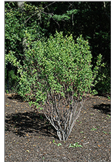
Rainbow Pillar Serviceberry

This is a relatively low maintenance shrub, and should not require much pruning, except when necessary, such as to remove dieback. It is a good choice for attracting birds to your yard, but is not particularly attractive to deer who tend to leave it alone in favor of tastier treats. It has no significant negative characteristics.