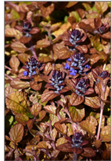
Feathered Friends Parrot Paradise Bugleweed flowers

This plant will require occasional maintenance and upkeep, and should not require much pruning, except when necessary, such as to remove dieback. It is a good choice for attracting butterflies to your yard, but is not particularly attractive to deer who tend to leave it alone in favor of tastier treats. Gardeners should be aware of the following characteristic(s) that may warrant special consideration;