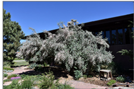
Blue Velvet Honeysuckle in bloom